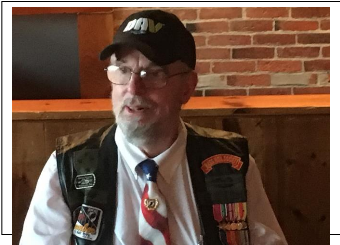
“Unity in Service”